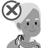
Around your neck