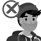
Under your nose