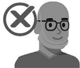
On your chin