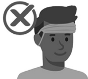
On your forehead