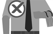
On your arm