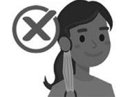
Dangling from one ear