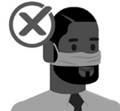
Only on your nose